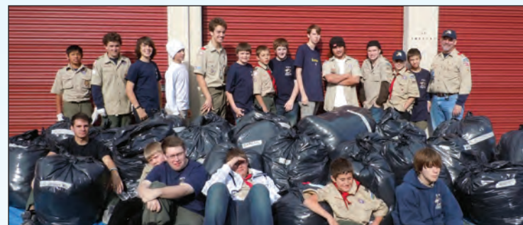
The Winter Garb drive was a great success thanks to Recology, the City of Vacaville, Boy Scout Troop 897 (pictured above), Christmas Wish, Golden West Middle School, Public Works Facilities Maintenance, Vacaville Neighborhood Boys and Girls Club, and Vacaville Youth In Action. Thanks to everyone who donated.

This newsletter was printed on recycled paper. Please recycle after reading.