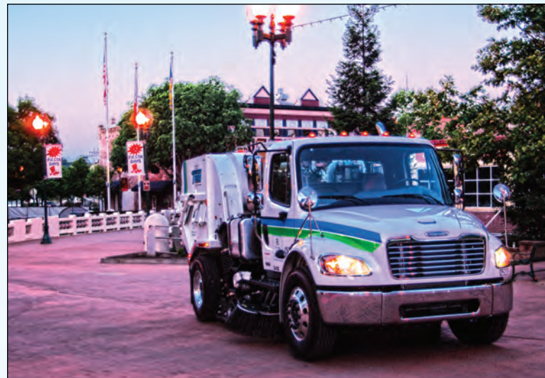
Recology is changing everything! Look for our new street sweeper as it scrubs the streets of Vacaville. The sweeper sports the Recology colors and logo.

Customers have options for extra yardwaste collection. The first option is to rent additional yardwaste Toters® from Recology . The second option is to use your own sturdy 32-gallon cans that have handles and tight fitting lids. The third option is to use twine to tie tree or shrub prunings into bundles that are no larger than 3 feet by 2 feet. There is no extra charge for bundles or extra cans. Place either beside your green Toter®. Your green Toter® must be set out to use Extra Yardwaste services.