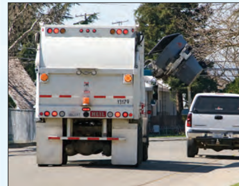
Use extra caution when approaching or passing working Recology trucks. Children, pets, and other dangers can be difficult to spot; so be careful driving near or around trucks.